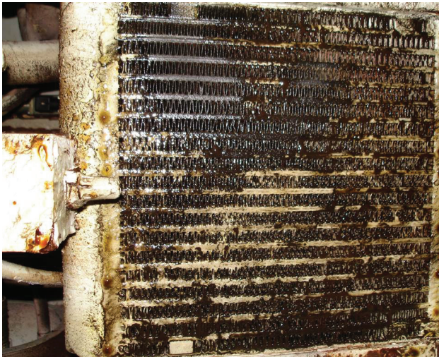
Dirty oil cooler

One of the biggest causes of failures of hydraulic systems is dirty oil. Although hydraulic oil may look clean, particles in the oil that cannot be seen by eye can cause control valves to jam and will also cause wear of components. Water in the oil can cause corrosion and if the oil emulsifies this can lead to sluggish operation. Routine oil analysis should be carried out to ensure that the oil is in a satisfactory condition and ideally, this should include a particle count.