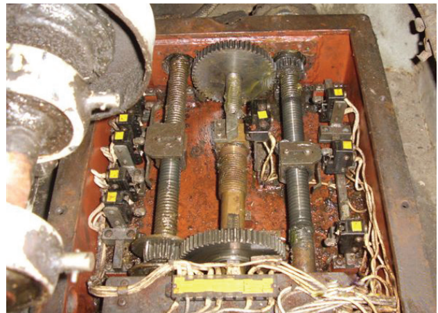
Limit switch cover missing

The brakes on the cranes should be regularly inspected and their condition recorded. Band brakes often have indicators to show the correct brake tension but linings should be checked to ensure they are of adequate thickness and are not contaminated with oil. Disk brakes are usually checked by measuring the clearance, and this should be recorded in the maintenance records.